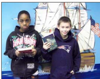
Excited RIF readers select their books at Southern Pines Elementary School.